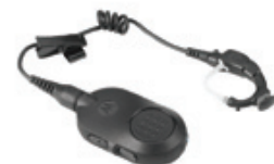
Operations Critical Wireless Earpiece

“When I first saw the MOTOTRBO SL Series I thought that it was a cell phone, not an actual two-way radio. It has all the capabilities of a two-way radio but with a professional, discreet look that fits absolutely well with all our uniforms.”